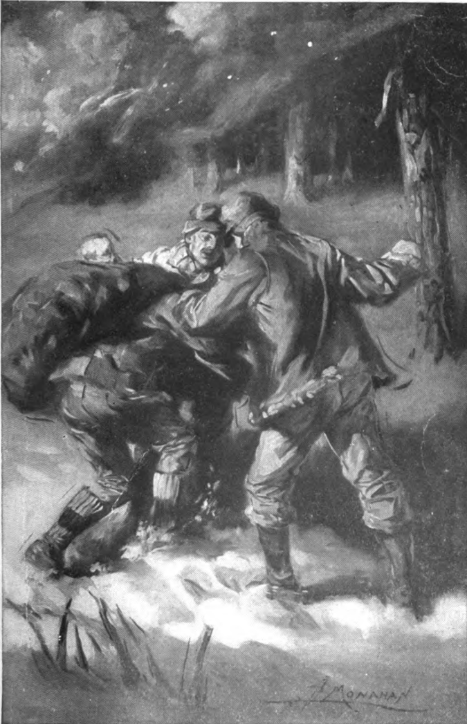
They hit him right and left at the same instant.