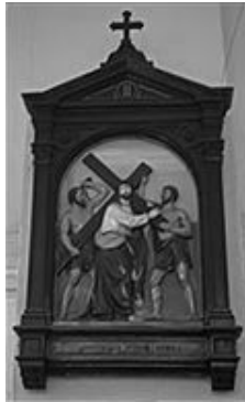
Jesus bears His Cross