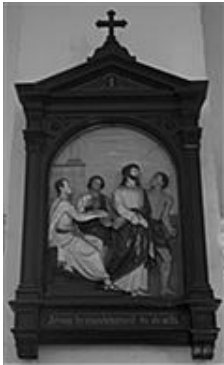
Jesus is condemned to death

Images are from photographs by Rangan Datta Wiki of Calcutta, generously released under the CC-BY-SA license, and are of the Stations of the Cross at the Portuguese Church in Calcutta (Kolkata), India. They have been converted to grayscale and separated for more appropriate use in this work.