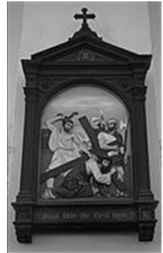
Jesus falls the first time