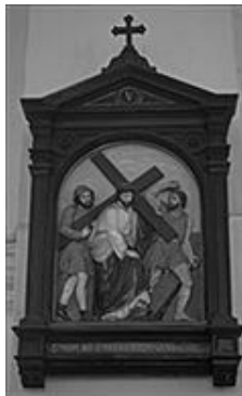
Jesus is helped by Simon