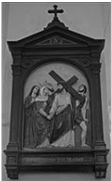
Jesus meets His Mother