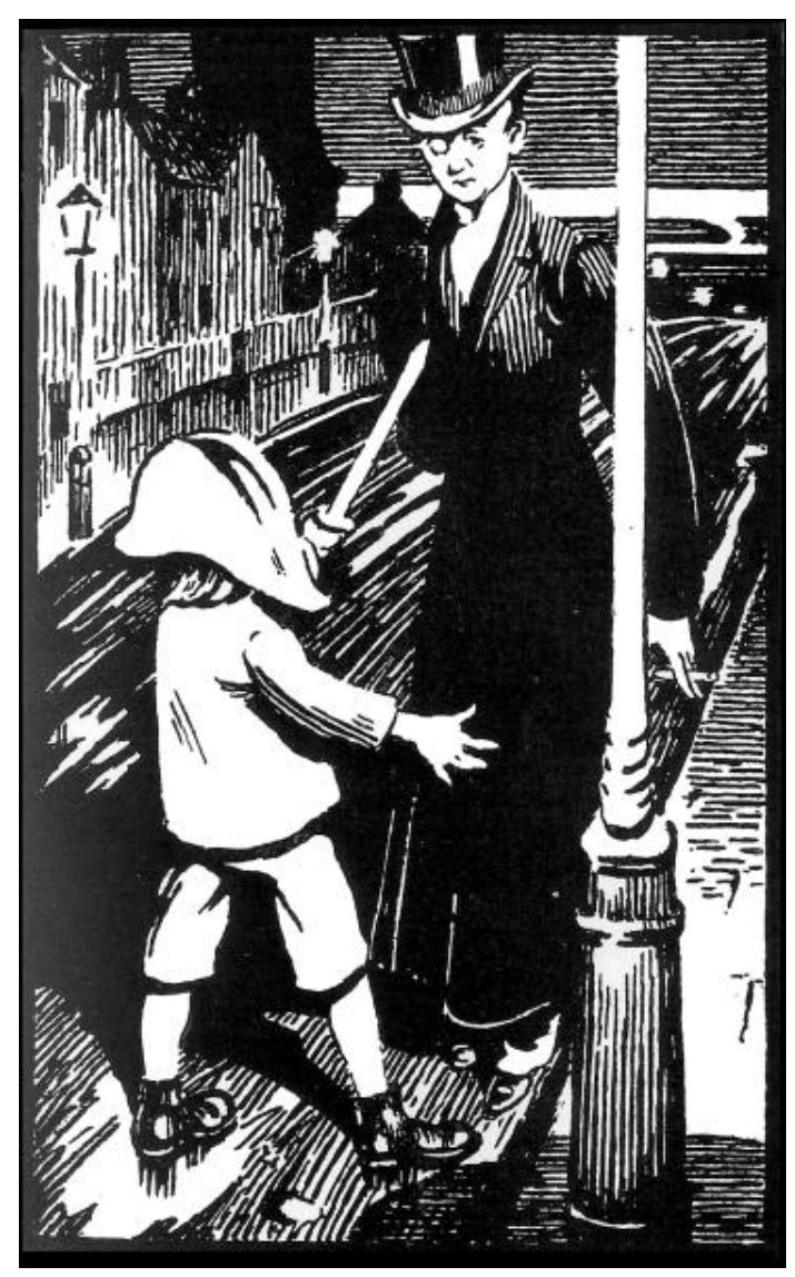
"I'm king of the castle."