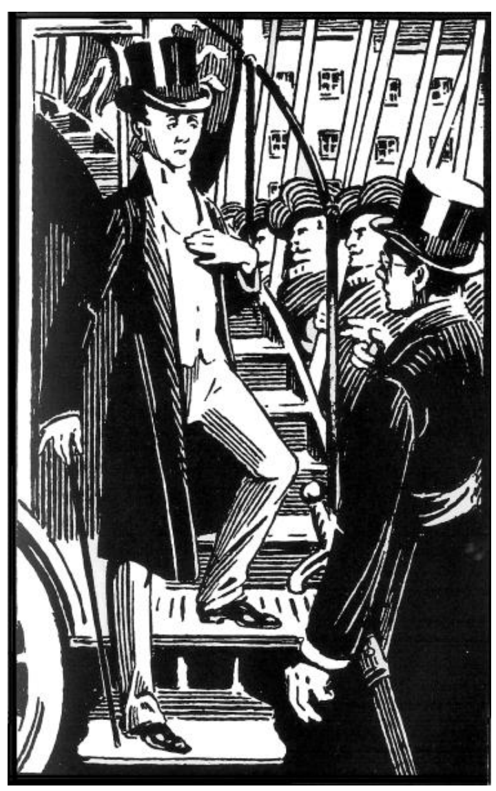
King Auberon descended from the omnibus with dignity.