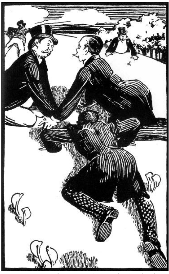
City Men Out on All Fours in a Field Covered with Veal Cutlets