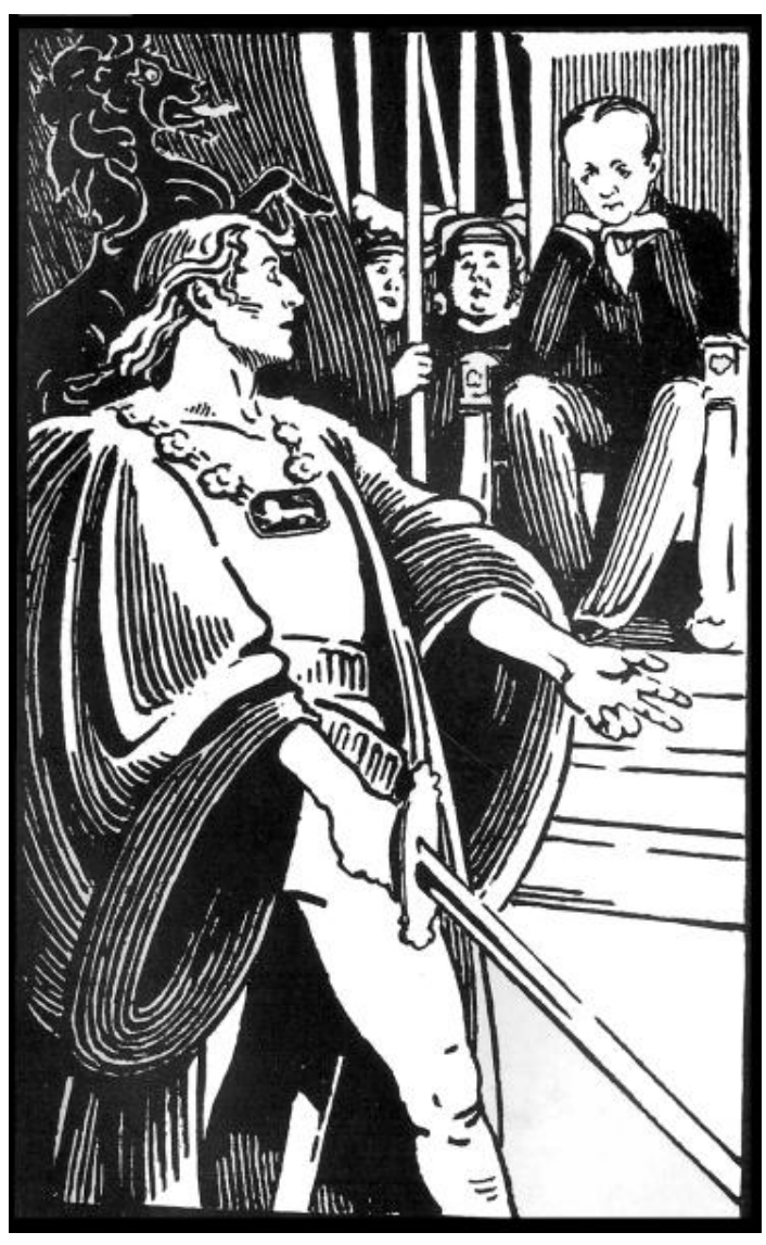
"I bring homage to my king."