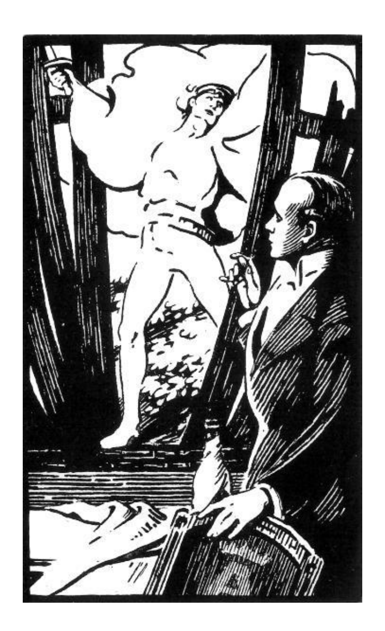
In the dark entrance there appeared a flaming figure.