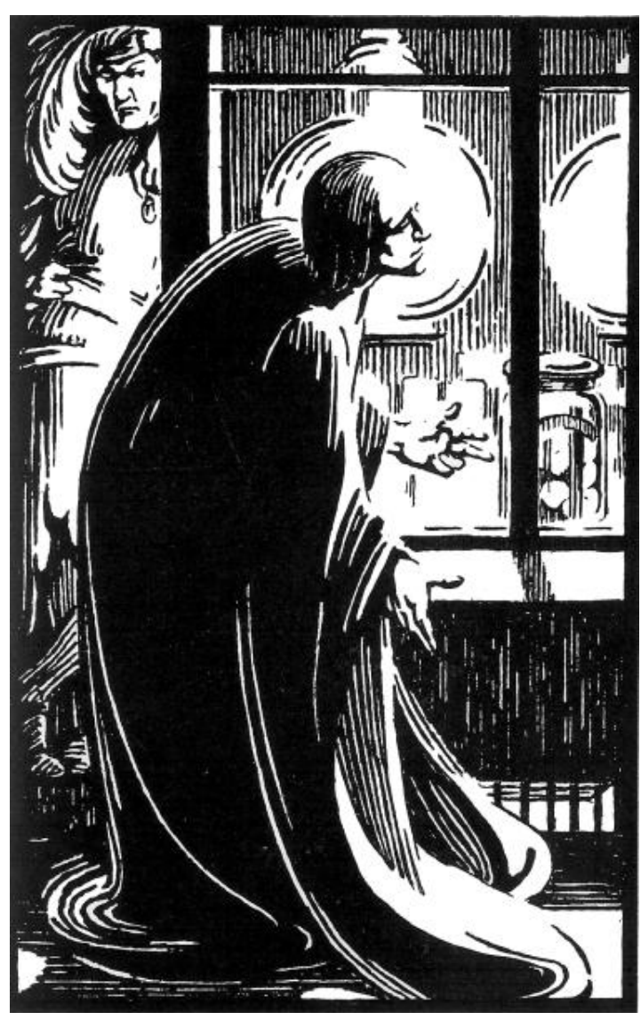
"A fine evening, sir," said the chemist.