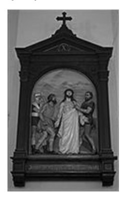
Jesus is stripped