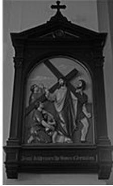
Jesus speaks to the women