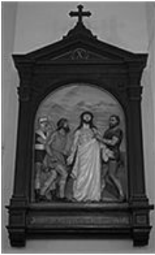
Jesus is stripped