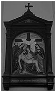
Jesus is taken down