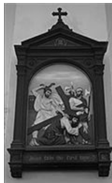
Jesus falls the first time