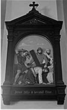
Jesus falls the second time