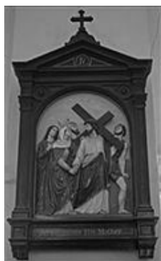
Jesus meets His Mother