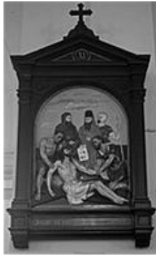
Jesus is nailed to the Cross