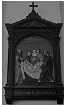
Jesus is placed in the tomb