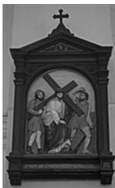
Jesus is helped by Simon