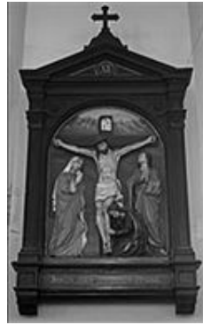
Jesus dies on the Cross