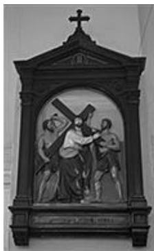
Jesus bears His Cross