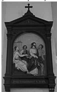
Jesus is condemned to death

Images are from photographs by Rangan Datta Wiki of Calcutta, generously released under the CC-BY-SA license, and are of the Stations of the Cross at the Portuguese Church in Calcutta (Kolkata), India. They have been converted to grayscale and separated for more appropriate use in this work.