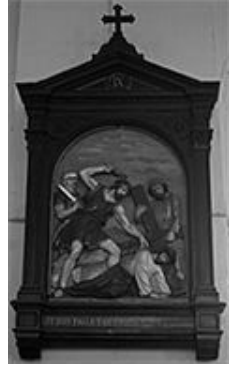
Jesus falls the third time