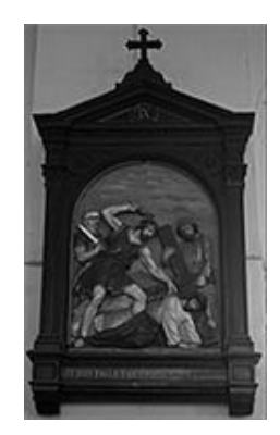
Jesus falls the third time