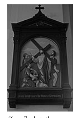
Jesus speaks to the women