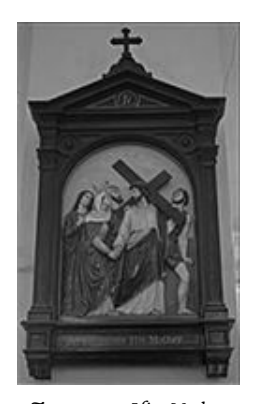
Jesus meets His Mother