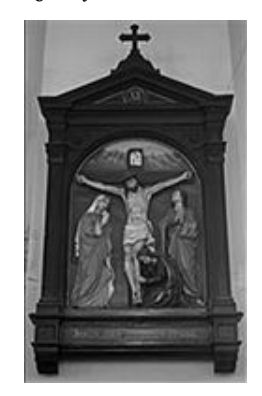
Jesus dies on the Cross